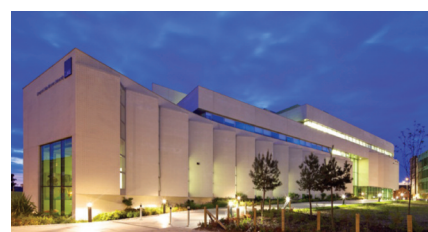
Venue: LJMU The John Lennon Art & Design Building