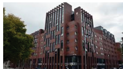
Accommodation: Vine Court, University of Liverpool or Hotels